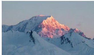
Mont blanc is the highest mountain in the Alps.

Popular activities in the Alps include skiing, hiking and sightseeing.